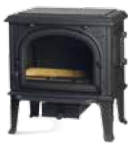
SAEY 200+ anthracite