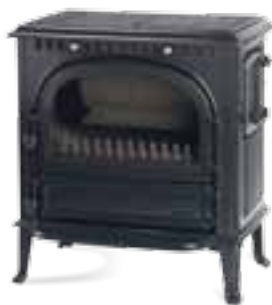
SAEY 92 black/blue enamel