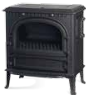
SAEY 92 anthracite