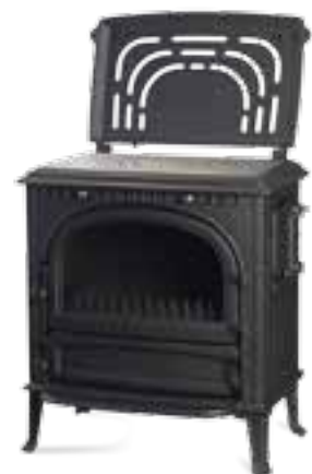
SAEY 92 CUCINA anthracite