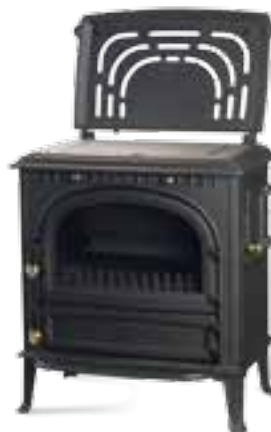
SAEY 92 TOP anthracite