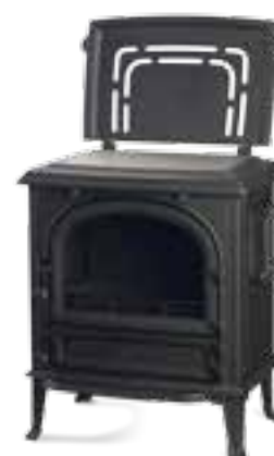
SAEY 94 CUCINA anthracite