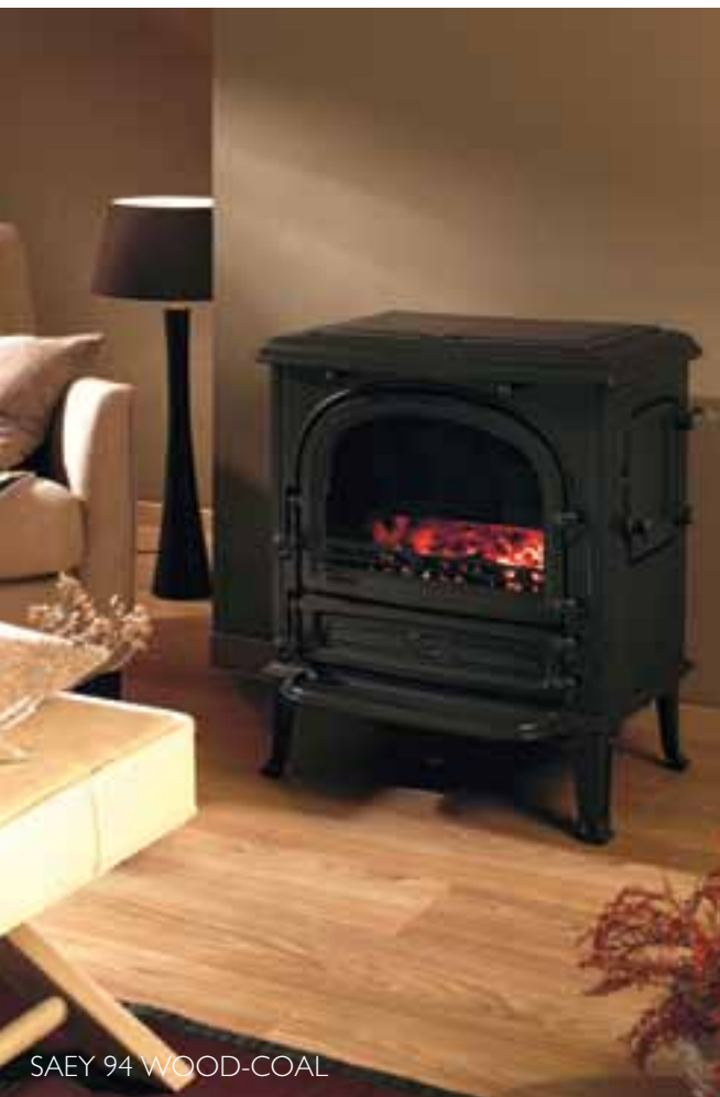
SAEY 94 WOOD-COAL