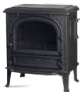
SAEY 94 anthracite