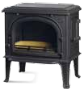
SAEY 200 anthracite