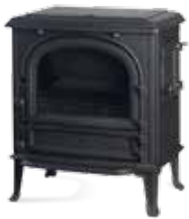
SAEY 94 anthracite