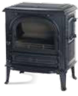
SAEY 94 black/blue enamel