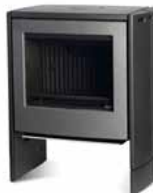
SCOPE XL bicolor