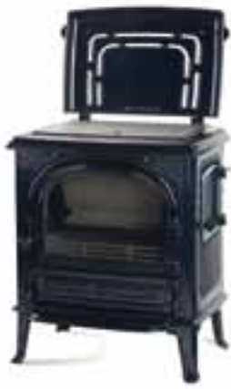
SAEY 94 TOP black/blue gloss enamel