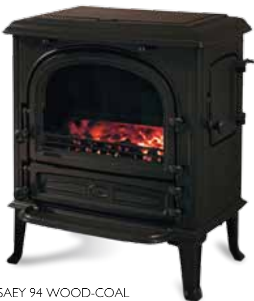
SAEY 94 WOOD-COAL