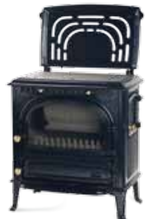
SAEY 92 TOP black/blue gloss enamel