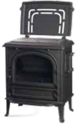
SAEY 94 TOP anthracite