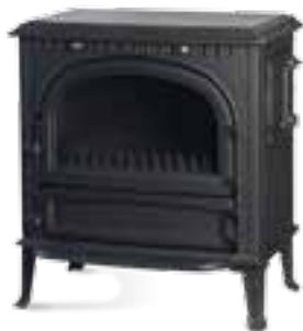
SAEY 92 anthracite