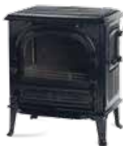
SAEY 94 black/blue gloss enamel