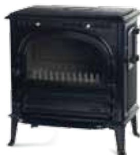
SAEY 92 black/blue gloss enamel