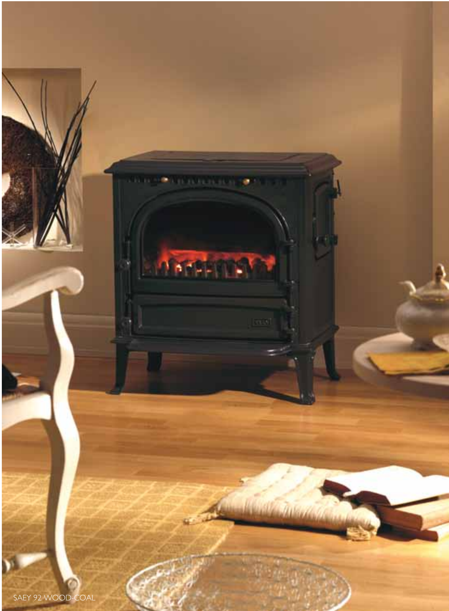
SAEY 92 WOOD-COAL