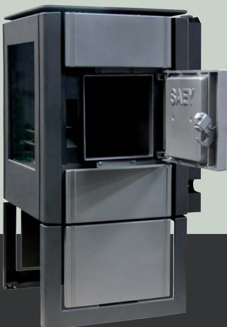
Right side panel with side filling door